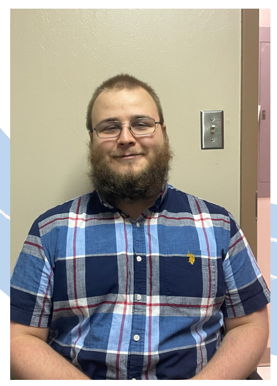
Bradley Bankhead Environmental Simpson